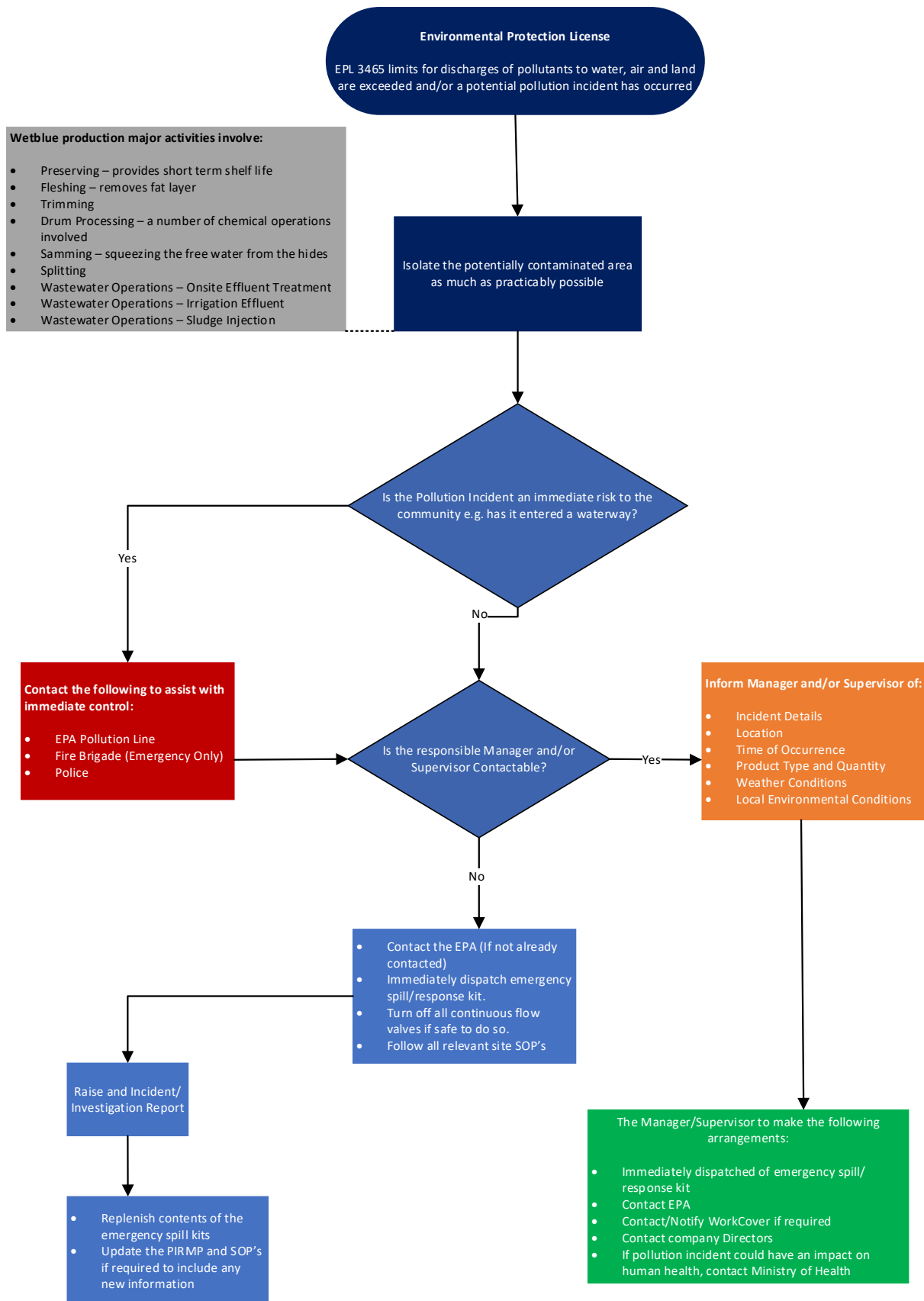
FIGURE 1: OVERVIEW OF INCIDENT RESPONSE PLAN