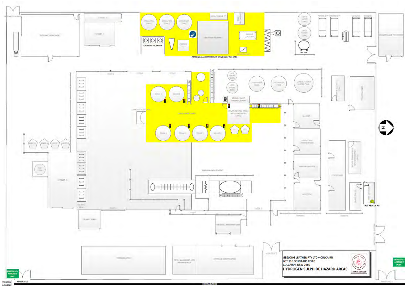
FIGURE 6: HYDROGEN SULPHIDE HAZARD AREAS